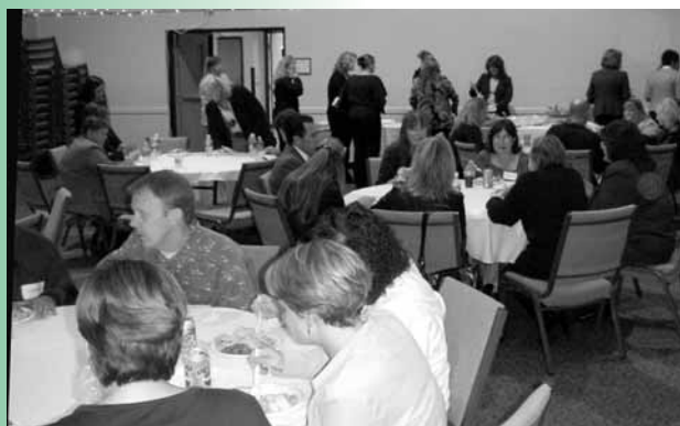
Course participants take lunch break at the Sunset Center in Rocklin.